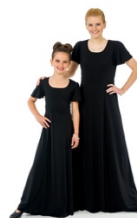
Christina dress , flutter sleeve style in black Machine washable Product #119