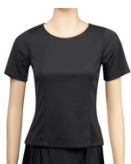
Melony blouse Machine washable Product #2201